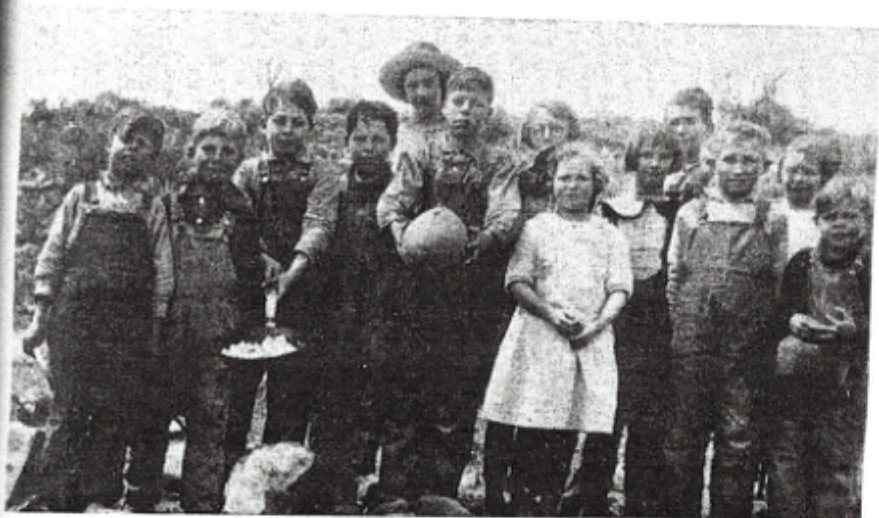
Picnic at Crystal School