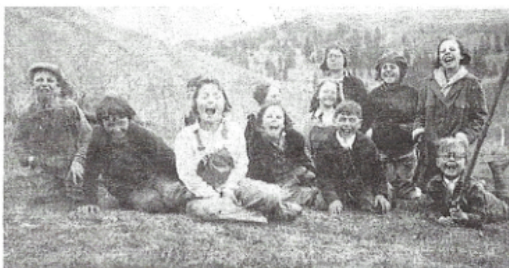
Whiting School picnic up Crystal Creek