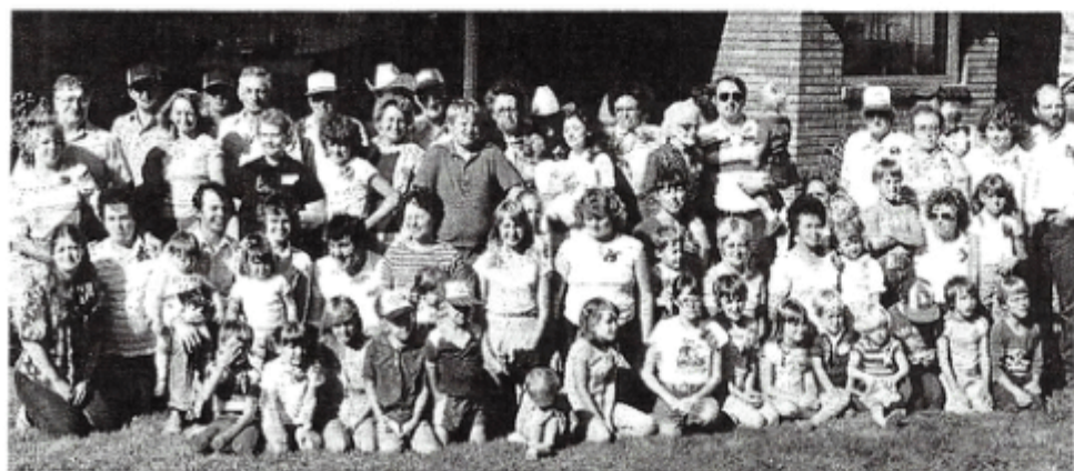
Whiting Family Reunion 1982 - Blackfoot, Idaho